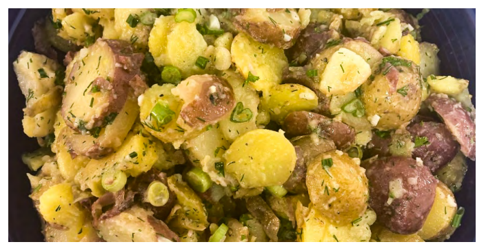
Kansas State University Agricultural Experiment Station and Cooperative Extension Service

Nutrition Information per 1 cup serving: 201 calories; 9g total fat (1g saturated fat, 0g trans fat); 29g carbohydrates; 3g protein; 2g fiber; 239mg sodium; 1g sugar.