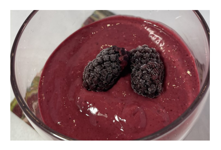
Like us on Facebook: Kansas State University Walk Kansas

Nutrition Information per 1 cup serving: 430 calories; 3 g total fat (0.5 g saturated fat, 0 g trans-fat); 89 g carbohydrates; 19 g protein; 13 g fiber; 70 mg sodium; 55 g sugar.